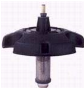
Compact Series 1/2-1 hp, three 150W fixtures

Mid Series Colors: Clear, Red, Blue, Green, Amber, Light Red, Turquoise