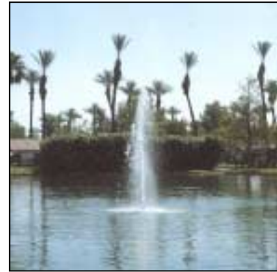
Heavy Water Sky Cascade