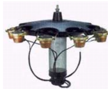
Mid Series 1/2-2 hp, up to nine 200, 300 or 500W fixtures